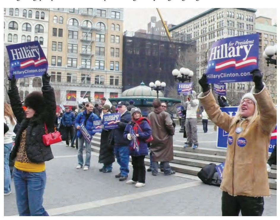
Hillary Clinton supporters rally in New York City.

Whether it's Clinton or Obama, change they're going to get!