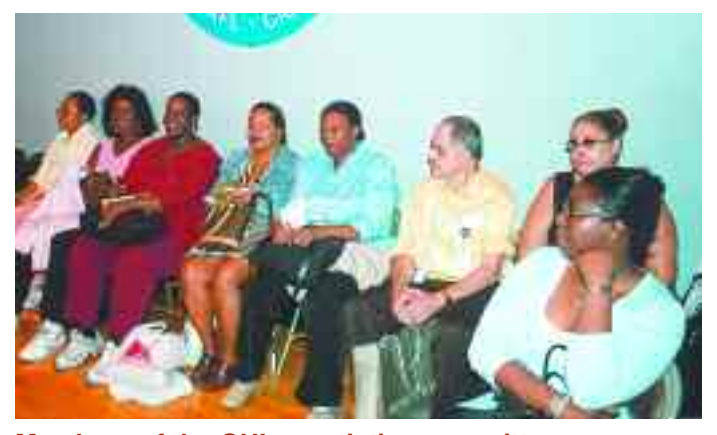
Members of the GHI negotiating committee.