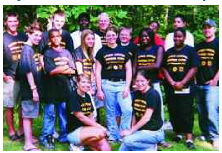
Campers at the Romeo Corbeil/Gilles Beauregard 2005 Summer Camp.