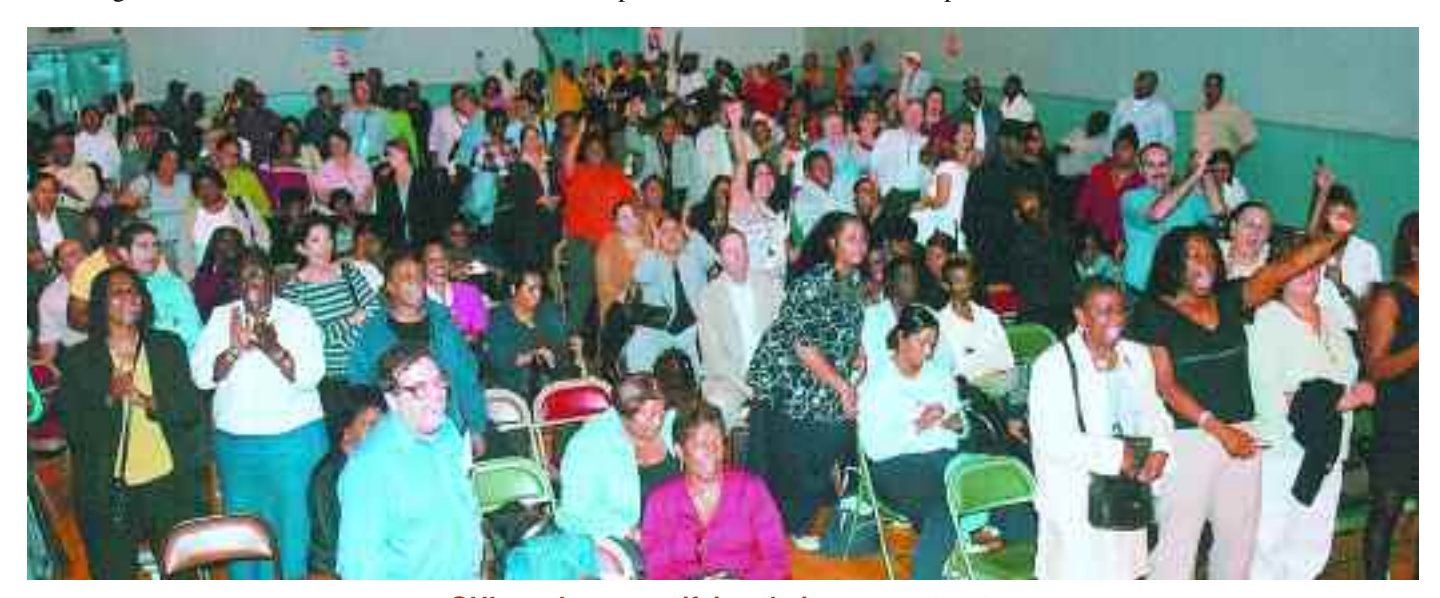
GHI employees ratifying their new contract.