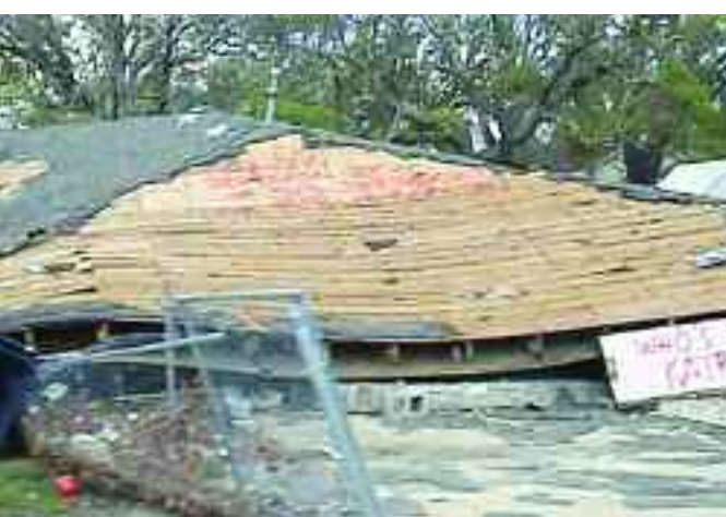
Photos taken by members of the OPEIU Hurricane Katrina/Rita Relief Fund Committee during a tour of the devastation left by Hurricane Katrina, primarily in the Gulfport/Biloxi, Mississippi area.