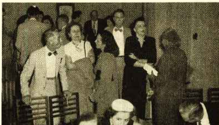
A "candid shot" of the delegates in discussion during a recess at the Dallas Conference.