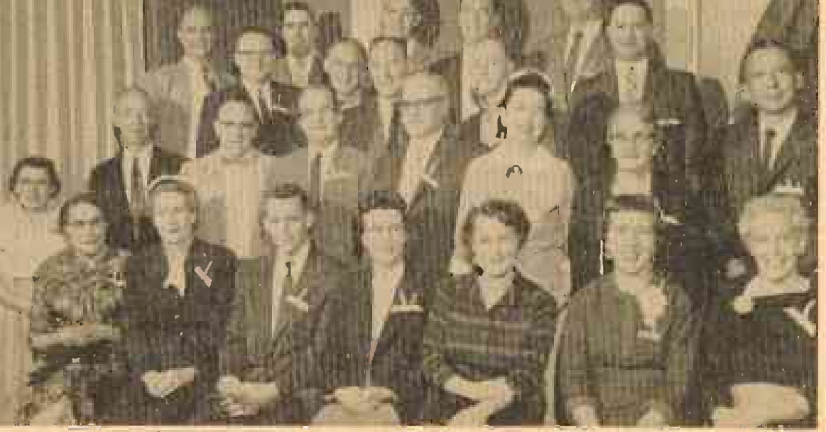
Pictured above are the delegates in attendance at the recent meeting of the Pacific Northwestern Organizational Conference held at the Winthrop Hotel in Tacoma, Washington.

Instead of berating the craft union, if the Committee insisted on getting into the case, it might just as well have asked the employer why he insisted on paying a $1.44 per hour less than his competitors.