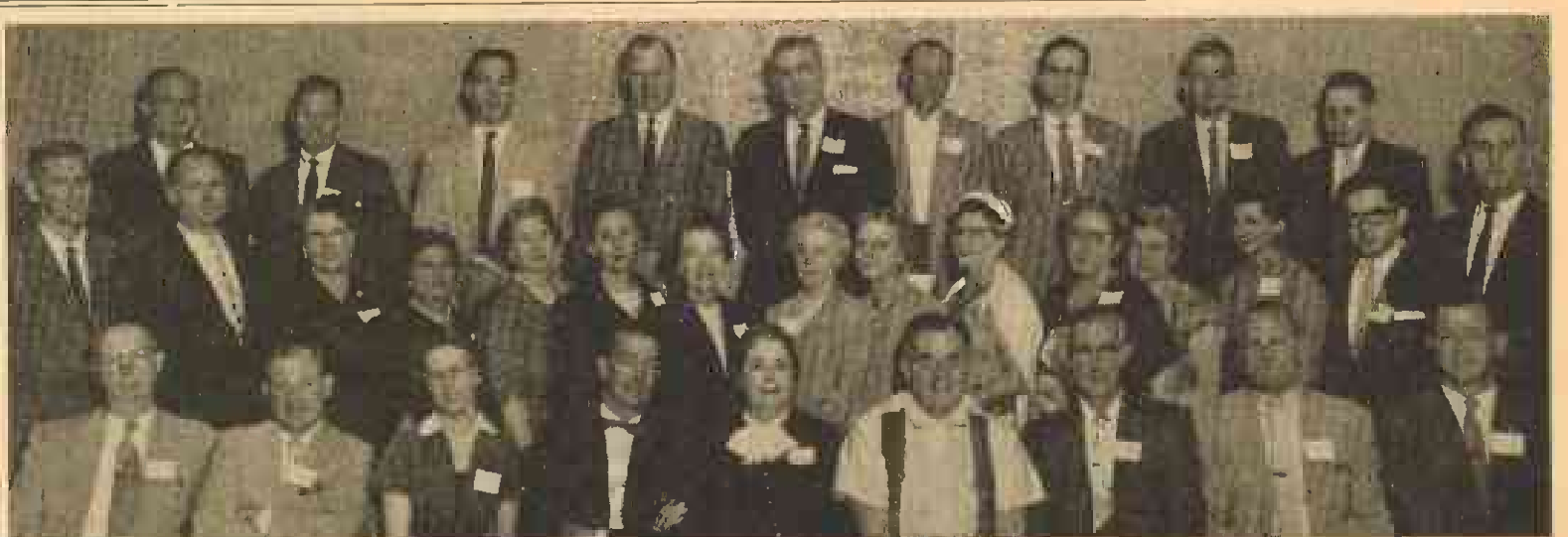
Delegates who attended the sessions at Fort Wayne, Ind. (Story, page one.)