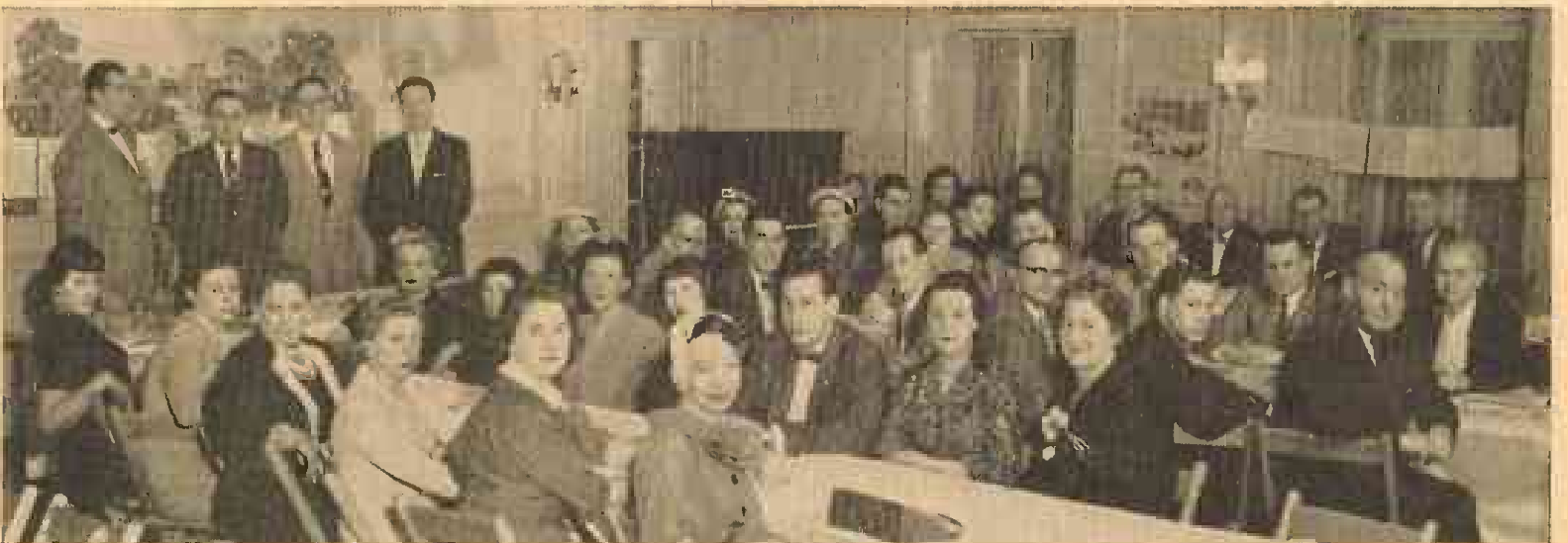
Participants in the recent meeting of the Erie Organizational Conference, which was held in Buffalo, April 19.

Buffalo Local 212 acted as host to a meeting of the Erie Organizational Conference held on Saturday, April 19.