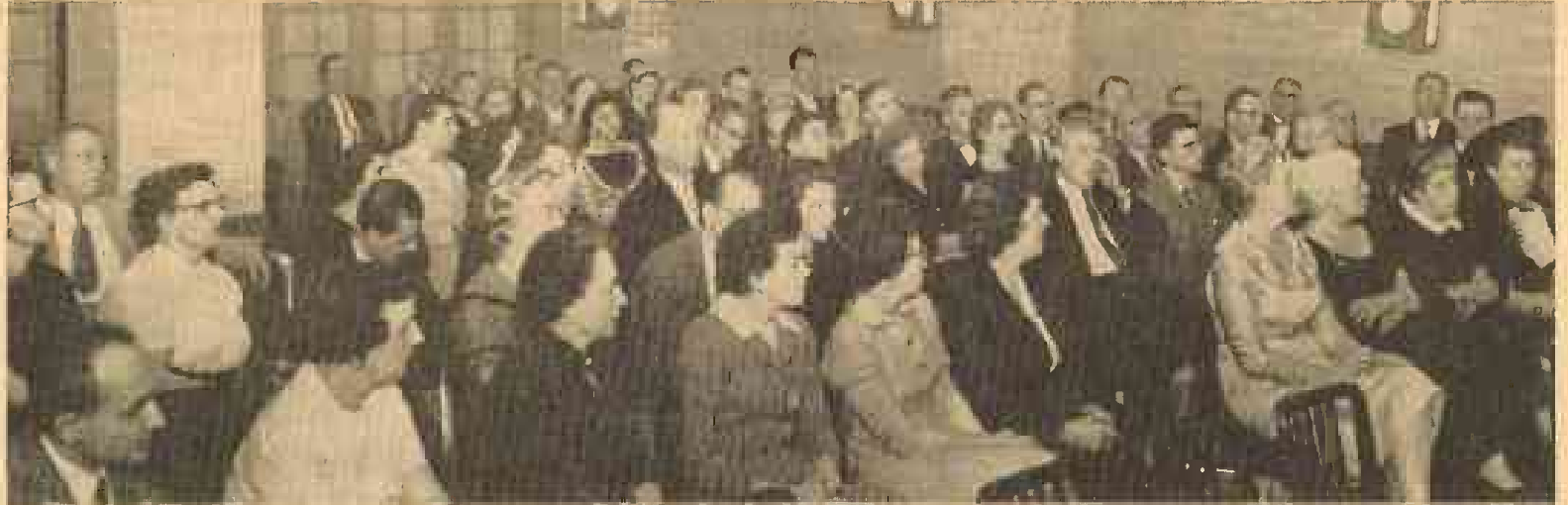
Part of the large gathering of delegates to the merger meeting of the Eastern Organizational Conference and the Northeastern Organizational Conference which assembled at the Hotel Lexington in New York City, March 22. There were 86 delegates in all at this important gathering.

A FTER receiving approval from the Executive Board of the Office Employees International Union, the Eastern Organizational Conference and the Northeastern Organizational Conference completed merger arrangements and held its first merged meeting at the Hotel Lexington in New York City on Saturday, March 22.