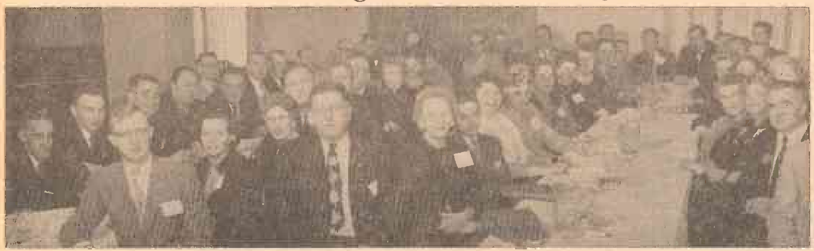
The North Central Conference, held November 5 and 6, attracted 56 delegates.

tral Organizational Conference on gene Dwyer. Saturday and Sunday, November 5