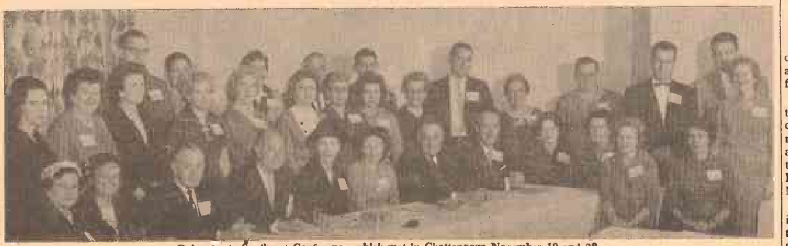
Delegates to Southeast Conference, which met in Chattanooga November 19 and 20.

Negotiations are now proceed-ing at the Sea-Lands Company, the second American company or-