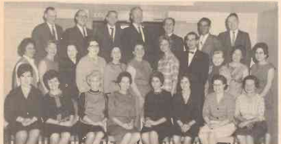
A Western Educational Conference was held recently in Denver, Colorado.