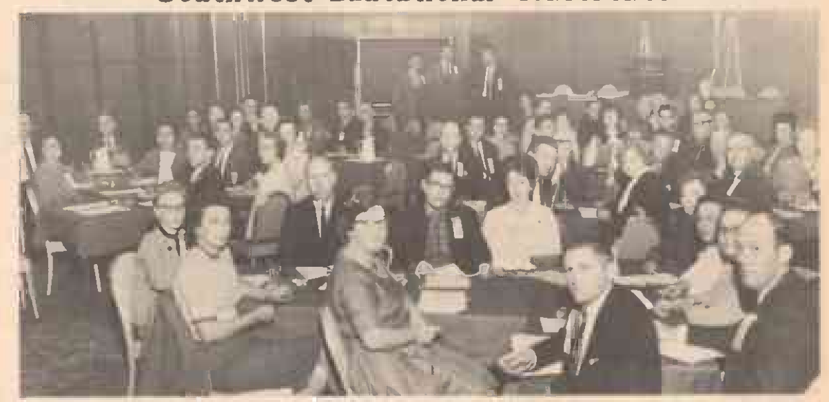
A successful Conference was held last month at the Rice Hotel in Houston, Texas.