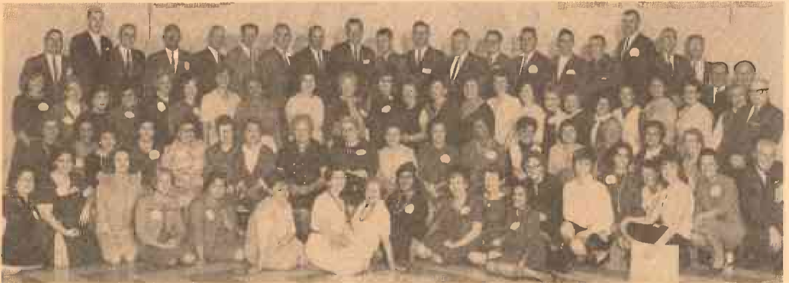
The Erie Council of the OPEIU met recently at the Nationwide Inn in Columbus, Ohio.