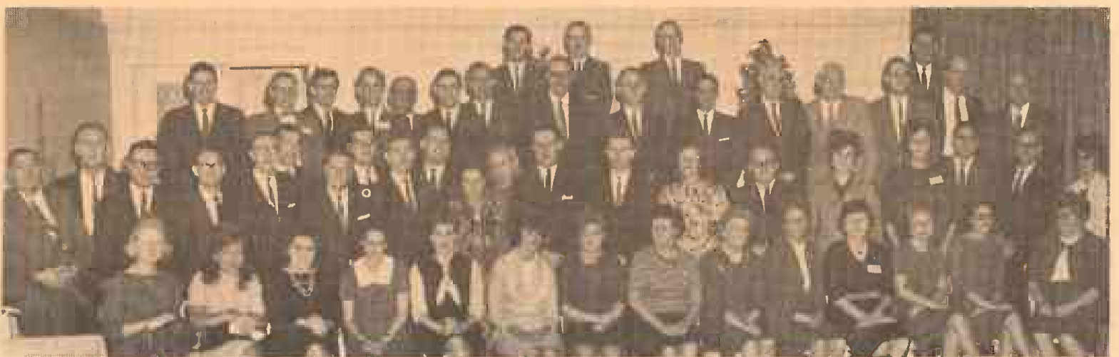
On December 4 and 5 the Northeastern Educational Conference was held at New London, Connecticut.