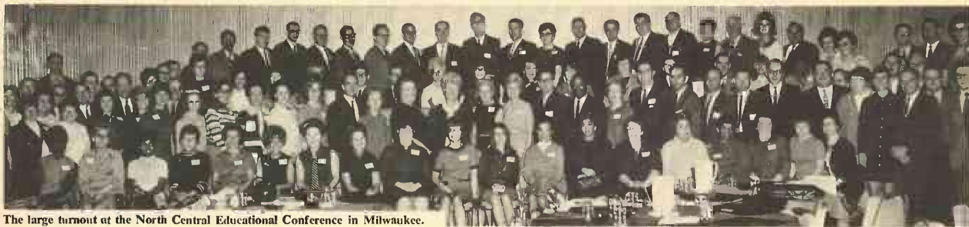
The large turnout at the North Central Educational Conference in Milwaukee.