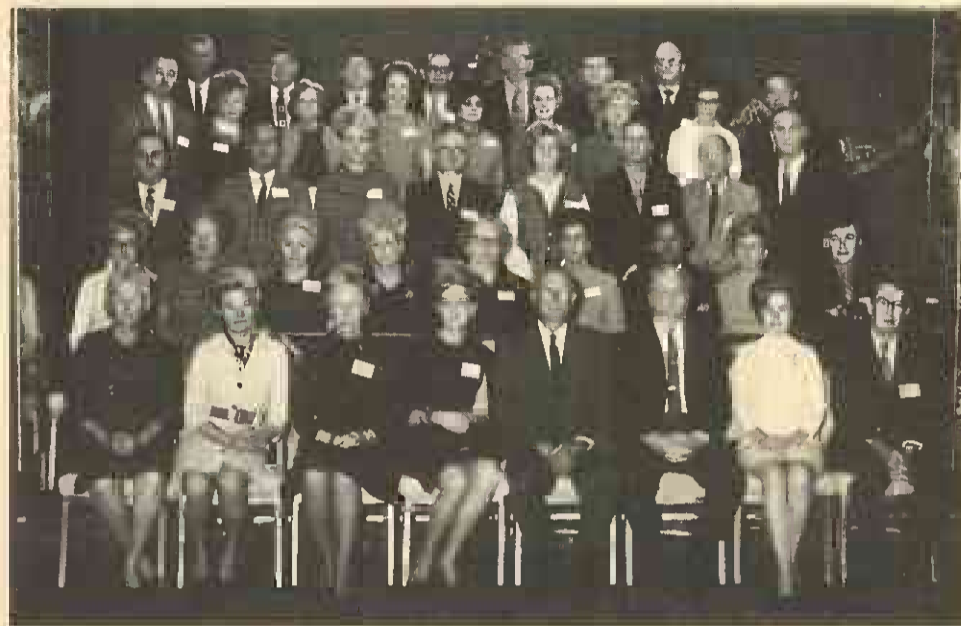
The Southwestern Educational Conference in Kansas City.