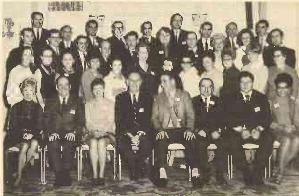
The East Canada Educational Conference in Toronto.