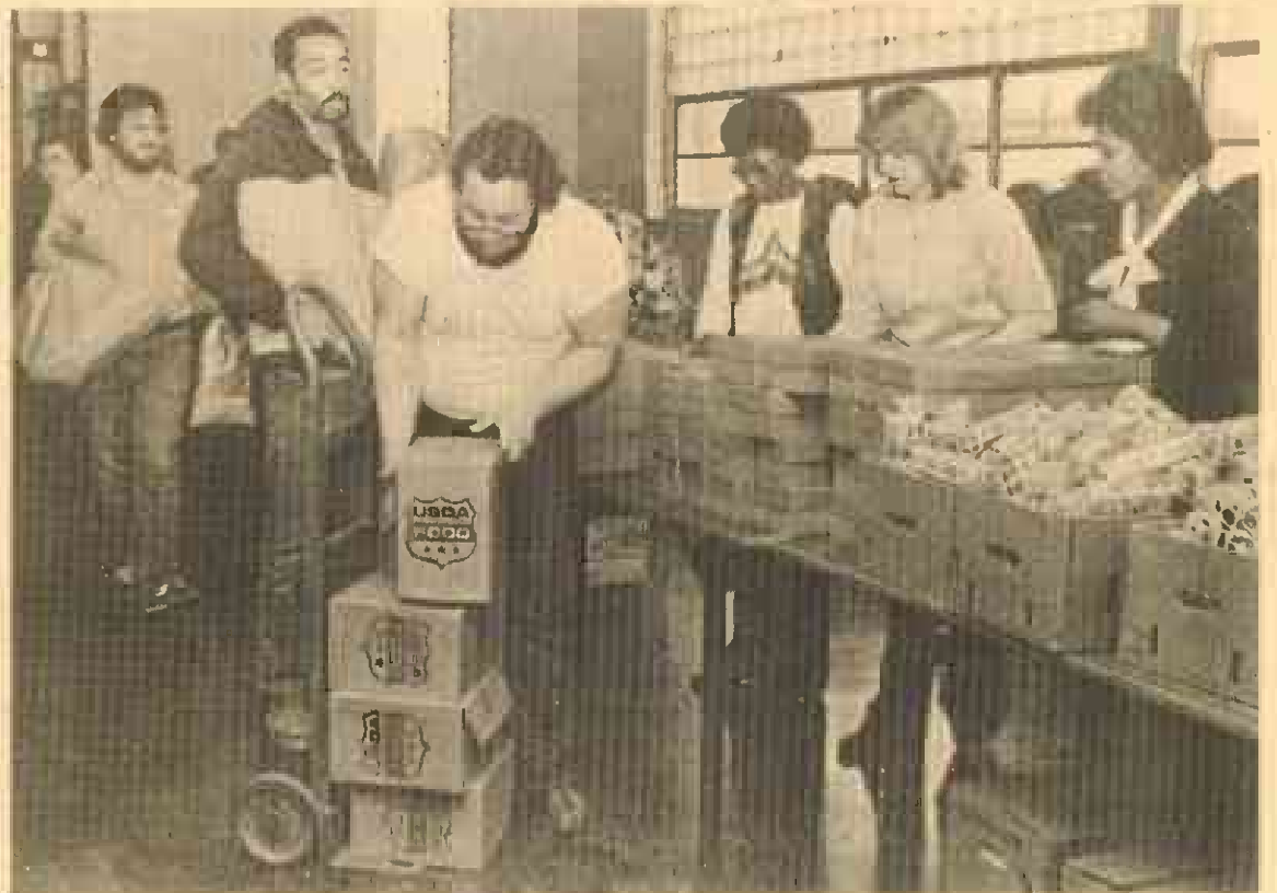
Hunger is on the increase in the United States, despite economic recovery, according to a survey of food programs by the non-profit Food Research and Action Center. The millions left unemployed, the rising number of poor and inadequate federal and state food programs were cited as reasons more Americans have turned to private food programs. This scene shows a food center in Baltimore.

Treatment is usually for life. But if high blood pressure is brought down to normal and kept there, the patient can expect to live a normal life with no major interference in day-to-day activities.