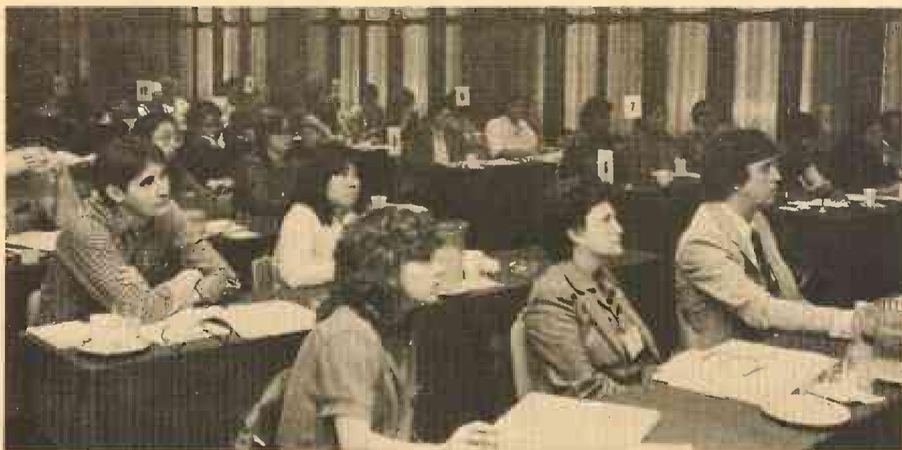
Participants at the Locals 28 and 391 training program are pictured above.

Shop stewards have always been the first-line of defense of OPEIU—protesting contract violations and protecting members' rights on the office/shop floor. Because of their importance to the members, training new and prospective stewards is a priority.